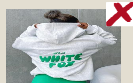
White Fox £50