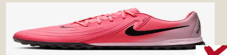
Nike over £50